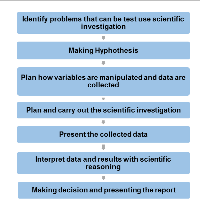
Figure 4: Steps in Carrying Out Experiments

An experiment is a method commonly used in science lessons. Pupils test hypotheses through investigations to discover specific science concepts and principles. Scientific methods are used when conducting an experiment involving thinking skills, science process skills, and manipulative skills. In general, procedures to follow when conducting an experiment as in Figure 4: